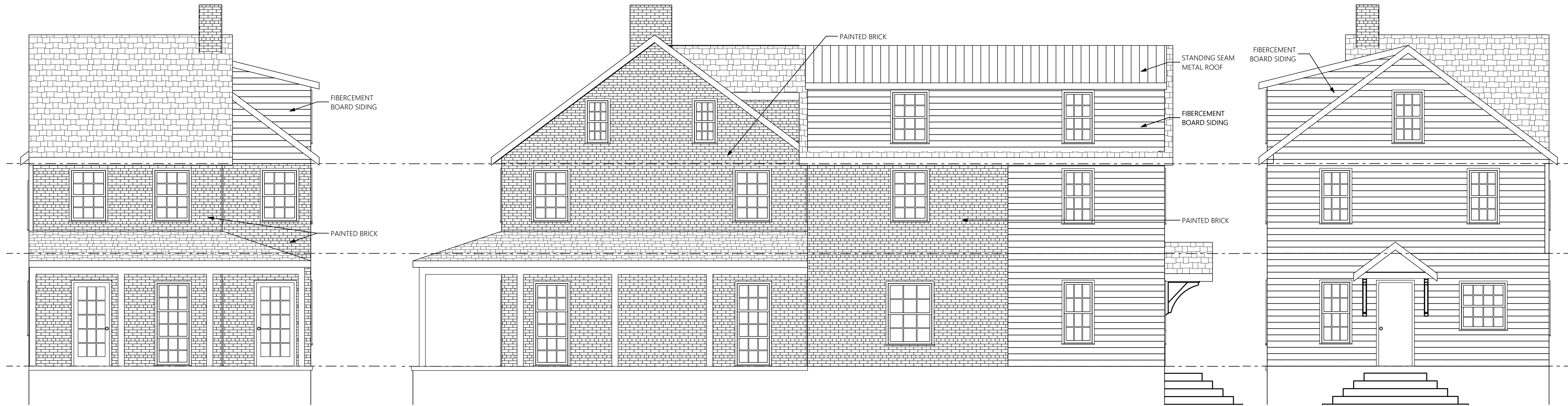
1 A-2 FRONT-ELEVATION SCALE: 1/4" = 1'-0"